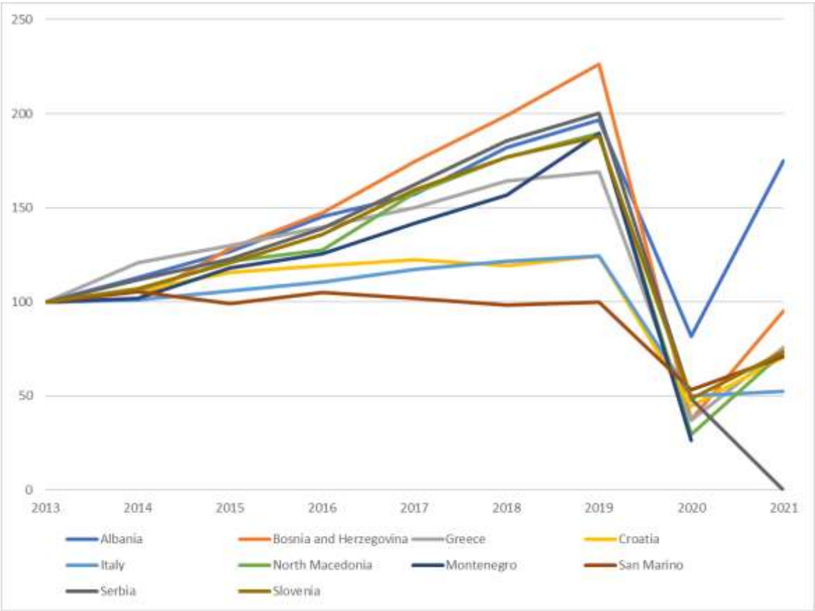
Figure 2 Number of arrivals of non-residents staying in hotels and similar accommodation establishments, 2013-2021 (2013=100)