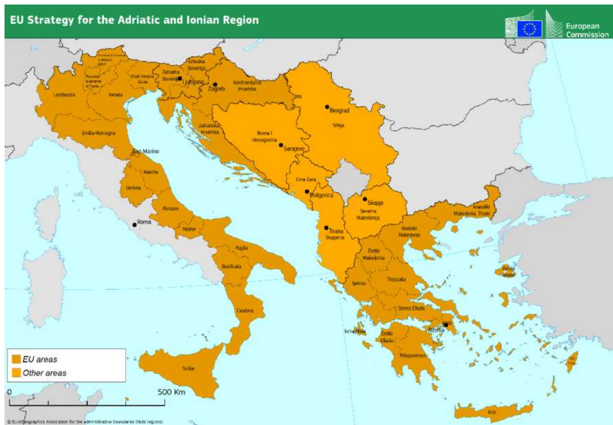
Figure 1 Map of EUSAIR countries